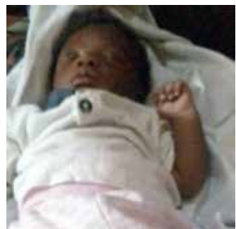
Photos of great grand-children